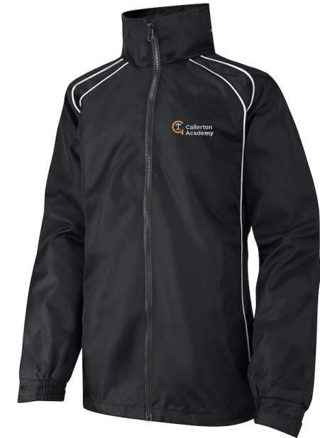
Callerton Academy Rain Jacket with Badge

All students must have the school rain jacket and/or outdoor micro fleece (which may be worn with the rain jacket)