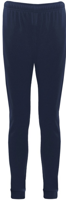
Unisex Performance Training Pants

These items may be purchased from Michael Sehgal's or other retailers