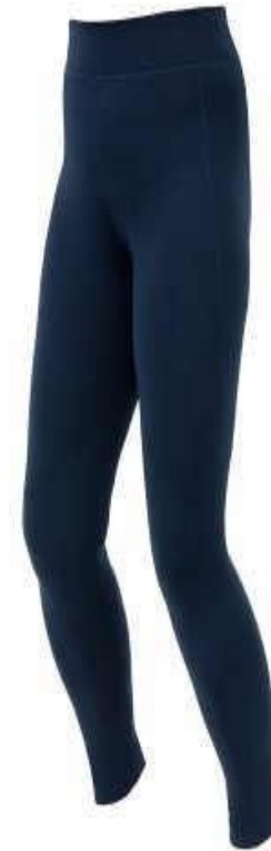
Performance Sports Leggings