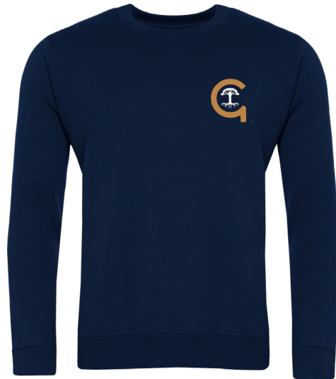
Callerton Academy Day Sweatshirt with badge