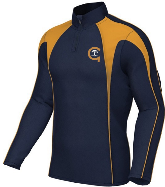
Navy/Amber ¼ Zip Midlayer