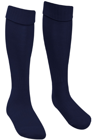
High Performance Sports Socks