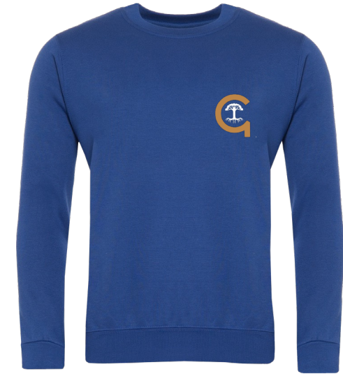
Callerton Academy PE Sweatshirt with badge