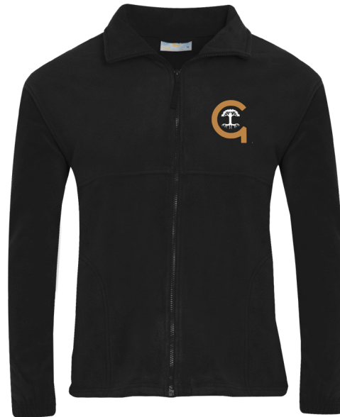
Callerton Academy Outdoor Micro-Fleece Jacket with badge