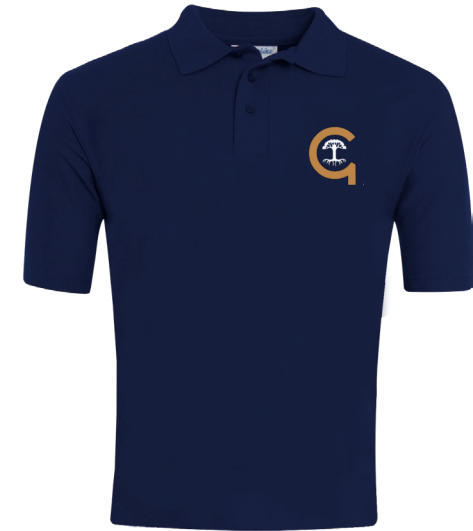
Callerton Academy Day Polo Shirt with badge