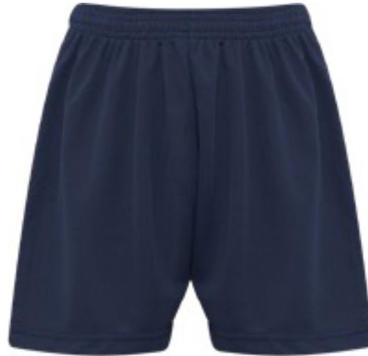
Unisex Performance Sports Shorts

Students must have either the navy/amber mid layer above, or the royal blue sweatshirt on the previous page for outdoor sports