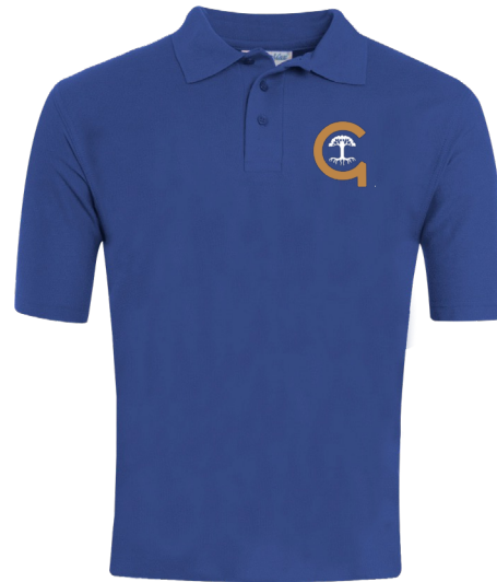
Callerton Academy PE Polo with badge